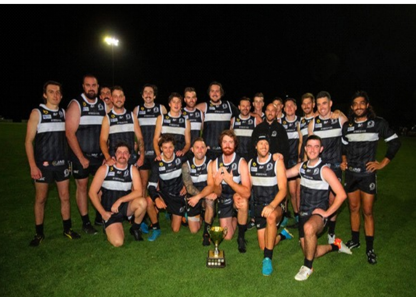
Top: A view of the match from the Eastern end played under the new lights. Centre: The Spirit of ANZAC medal. Left: The victorious Magpies team with the Maczkowiack Cup.