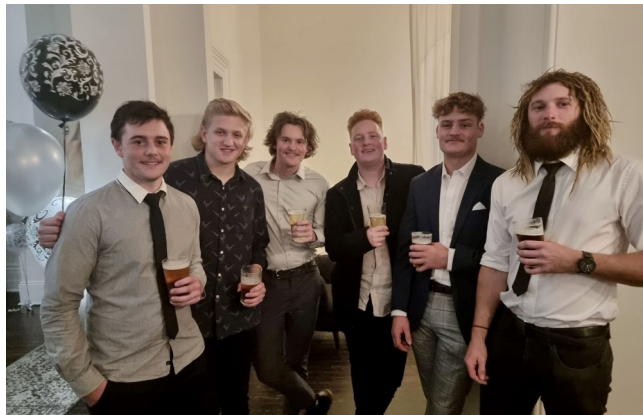
At The Cumby. There was glamour (above) and ... er ... well ... some blokes trying hard to match the girls but having a good time anyway!