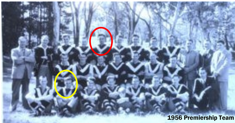
1956 Premiershhip Team